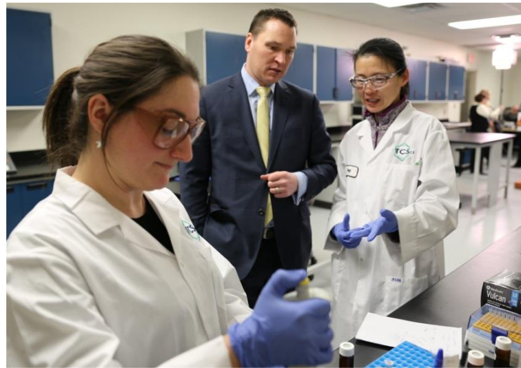
TC Scientific – a chemistry research company that received funding through the SME Export Support Fund.

Provides support to Alberta small and medium-sized companies in entering new markets by covering half the costs of flights, hotels, registration at events, and translation of marketing materials.