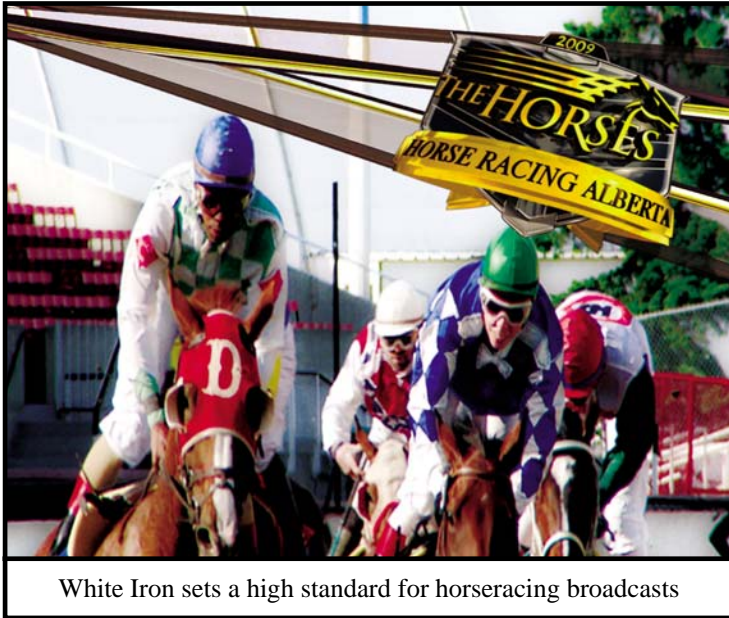
White Iron sets a high standard for horseracing broadcasts